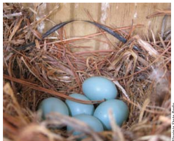
Virginia State Parks